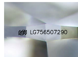
Sample Image Used

Red symbols indicate internal characteristics. Green symbols indicate external characteristics.