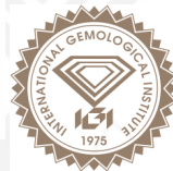
HEARTS & ARROWS