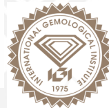
HEARTS & ARROWS