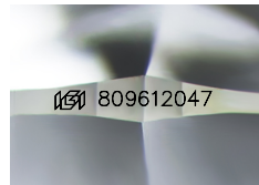
Sample Image Used