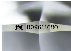
Sample Image Used

Polish EXCELLENT Symmetry VERY GOOD Fluorescence VERY SLIGHT Identification Features FEATHER Inscription(s) IGI 809611680