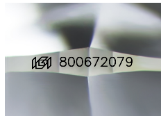
Sample Image Used

Polish EXCELLENT Symmetry EXCELLENT Fluorescence SLIGHT Identification Features FEATHER Inscription(s) IGI 800672079 Comments: IDEAL CUT ROUND BRILLIANT