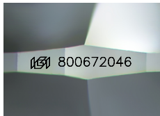
Sample Image Used

Polish EXCELLENT Symmetry EXCELLENT Fluorescence VERY SLIGHT Identification Features CRYSTAL, FEATHER Inscription(s) IGI 800672046 Comments: IDEAL CUT ROUND BRILLIANT