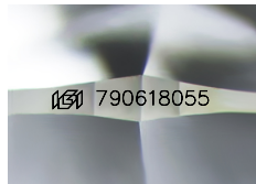
Sample Image Used

Polish EXCELLENT Symmetry EXCELLENT Fluorescence NONE Identification Features CRYSTAL, FEATHER, CLOUD Inscription(s) IGI 790618055