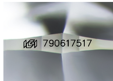
Sample Image Used

Polish EXCELLENT Symmetry EXCELLENT Fluorescence NONE Identification Features FEATHER, CRYSTAL Inscription(s) IGI 790617517