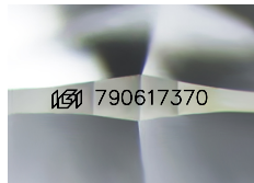
Sample Image Used

Polish EXCELLENT Symmetry EXCELLENT Fluorescence NONE Identification Features FEATHER, CRYSTAL CLOUD Inscription(s) IGI 790617370