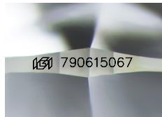
Sample Image Used

Polish EXCELLENT Symmetry EXCELLENT Fluorescence NONE Identification Features CRYSTAL, FEATHER, CLOUD Inscription(s) IGI 790615067