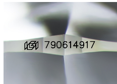
Sample Image Used

Polish EXCELLENT Symmetry EXCELLENT Fluorescence NONE Identification Features FEATHER Inscription(s) IGI 790614917 Comments: IDEAL CUT ROUND BRILLIANT