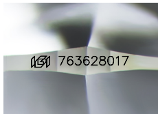
Sample Image Used

Polish EXCELLENT Symmetry EXCELLENT Fluorescence NONE Identification Features FEATHER Inscription(s) IGI 763628017 Comments: IDEAL CUT ROUND BRILLIANT