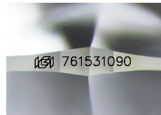
Sample Image Used