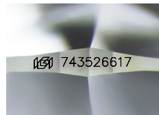
Sample Image Used