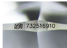
Sample Image Used