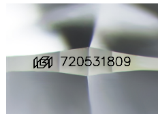
Sample Image Used