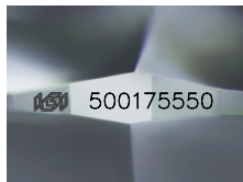
Sample Images Used

January 6, 2022 IGI Report Number 500175550 Description NATURAL DIAMOND Shape and Cutting Style ROUND BRILLIANT Measurements 4.79 - 4.83 x 3.07 mm